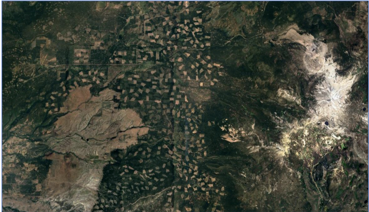
Extensive clearcutting (~20-acre patches) on the western slopes of Mt. Lassen.

A new report by the Center for Sustainable Economy focuses on two California Counties to expose a critical gap in California's climate strategy: the unregulated greenhouse gas emissions (GHG) from the state's logging industry. Despite California's reputation as a climate leader, California does not monitor GHG emissions from the logging and wood products sector and has no plans to do so. Erroneously assuming that logging-related emissions are offset by future forest growth or the substitution of wood products for more carbon-intensive materials, California ignores the fact that logging practices emit far more carbon than the natural forests they replace, significantly contributing to climate instability.