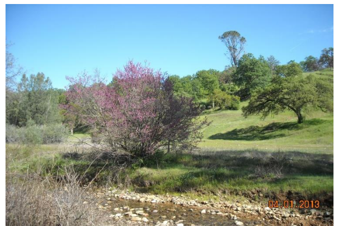
Redbud in bloom in floodplain of Oregon Gulch

This will be an easy four-mile fieldtrip on the BLM Cloverdale Trail area west of Redding near Igo. SEA led a field trip here last year, but part of this hike will be on a different section of the trail on part of the loop and will include the overlook of the Clear Creek canyon. SEA will provide a plant list for the many wildflowers that should be blooming. Well trained dogs on leash okay. Sprinkles or light rain, bring an umbrella, heavy rain cancels. Limited to 15 people, to reserve a space and for more information, contact David Ledger at david@ecoshasta.org .