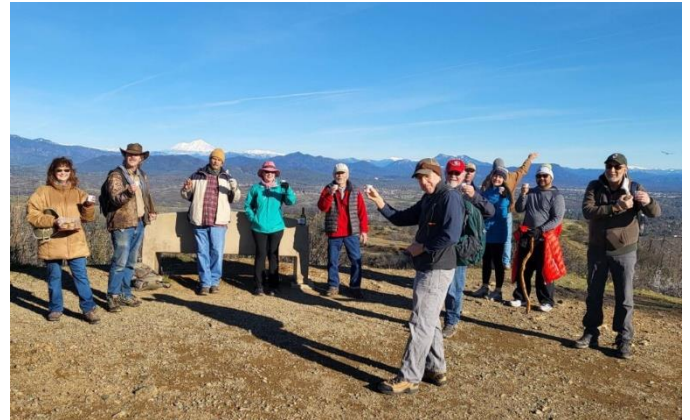
A toast at "Top of the World" by SEA hikers. Photo by Doug Mandel. Wine by Yo Sadahora.

Only the coyote-brush ( Baccharis pilularis ), white-leaved manzanita ( Arctostaphylos viscida ssp. viscida ), and scattered fragrant cudweed ( Pseudognaphalium beneolens ) were in bloom, but many plants were identified by their leaves, last year's seeds, and growth form, such as buckbrush ( Ceanothus cuneatus var. cuneatus ), Pacific hound's-tongue ( Cynoglossum grande ), and gold-backed fern ( Pentagramma triangularis ). Toyon ( Heteromeles arbutifolia ) was prolific on the trail, its bright red berries providing food for robins, bluebirds, and bears.