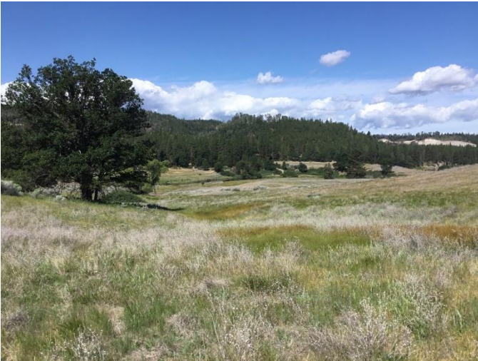
Part of Hat Creek land returned to Pit River Tribe.

In November we succeeded with the conservation of Ross Ranch , a 854-acre living laboratory for ecological education, sustainable agriculture, and future public access to hiking and birdwatching.