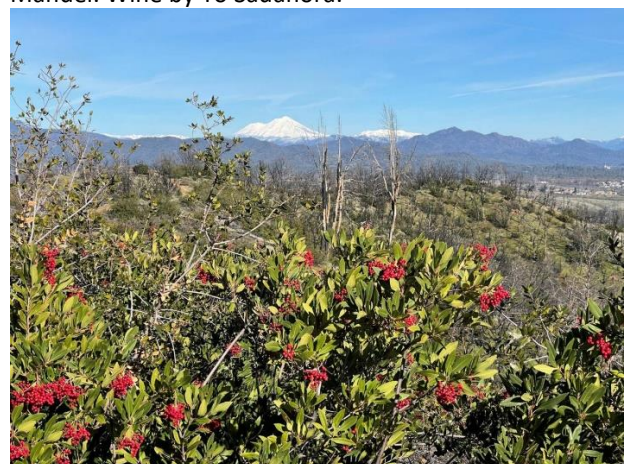
View on the trail of toyon and Mt. Shasta